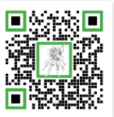
ST. MICHAEL'S QR CODE

PARISH Support WAYS TO MAKE A DONATION www.lncc.dol.ca/donate