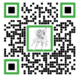
ST. MICHAEL'S QR CODE

PARISH Support WAYS TO MAKE A DONATION www.lncc.dol.ca/donate