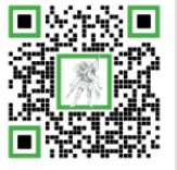
ST. MICHAEL'S QR CODE

PARISH Support WAYS TO MAKE A DONATION www.lncc.dol.ca/donate