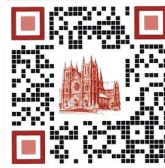
ST. PETER'S QR CODE

PARISH Support WAYS TO MAKE A DONATION www.lncc.dol.ca/donate