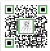
ST. MICHAEL'S QR CODE

PARISH Support WAYS TO MAKE A DONATION www.lncc.dol.ca/donate