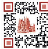
ST. PETER'S QR CODE

PARISH Support WAYS TO MAKE A DONATION www.lncc.dol.ca/donate