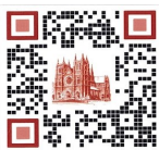
ST. PETER'S QR

Thank you for giving, your donations make a difference!