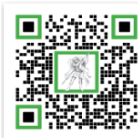
ST. MICHAEL'S QR

Simply open your phone's camera, hover over the QR code of the parish you would like to donate to and click the link that appears!