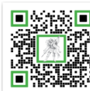
ST. MICHAEL'S QR

Simply open your phone's camera, hover over the QR code of the parish you would like to donate to and click the link that appears!