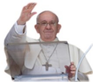
Pope Francis

feeling, because it is meant for everyone. Stay close in particular to your friends who may be smiling on the outside but are weeping within, for lack of hope. Do not let yourselves be infected by indifference and individualism. Remain open, like canals in which the hope of Jesus can flow and spread in all the areas where you live."