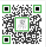
ST. MICHAEL'S QR CODE

PARISH Support WAYS TO MAKE A DONATION www.lncc.dol.ca/donate