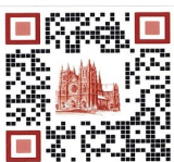
ST. PETER'S QR