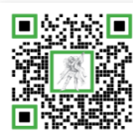
ST. MICHAEL'S QR

Simply open your phone's camera, hover over the QR code of the parish you would like to donate to and click the link that appears!