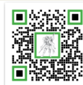
ST. MICHAEL'S QR CODE

PARISH Support WAYS TO MAKE A DONATION www.lncc.dol.ca/donate