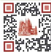
ST. PETER'S QR CODE

PARISH Support WAYS TO MAKE A DONATION www.lncc.dol.ca/donate