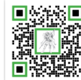
ST. MICHAEL'S QR CODE

PARISH Support WAYS TO MAKE A DONATION www.lncc.dol.ca/donate