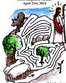
Help the sheep find the Good Shepherd and stay away from the hungry wolf!

4th Sunday of Easter Good Shepherd Sunday April 21st, 2024