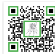
ST. MICHAEL'S QR

Simply open your phone's camera, hover over the QR code of the parish you would like to donate to and click the link that appears!