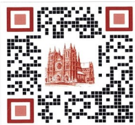
ST. PETER'S QR CODE

Simply open your phone's camera, hover over the QR code of the parish you would like to donate to and click the link that appears!