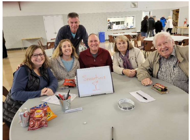
Congratulations to the 2023 Winning Team The Smartinis